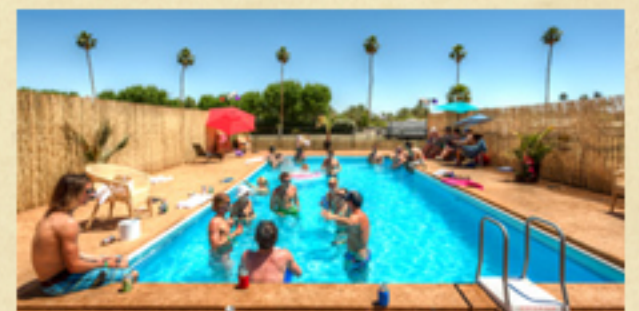
safari world pool