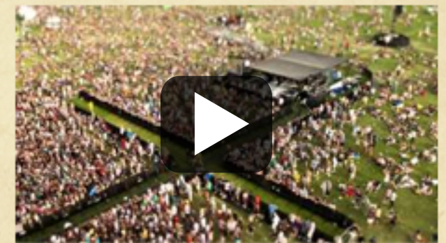
3 days of coachella in 4 minutes