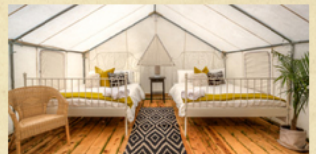
two queen bed tent

You're probably saying to yourself "stop talking and tell me how to enter," right? I mean, 'please' would've been nice, but that's ok. All you need to do is answer three simple questions [seriously, they're easy - and there are links to the answers], give us your name, email address and zip