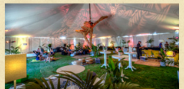
safari world lounge